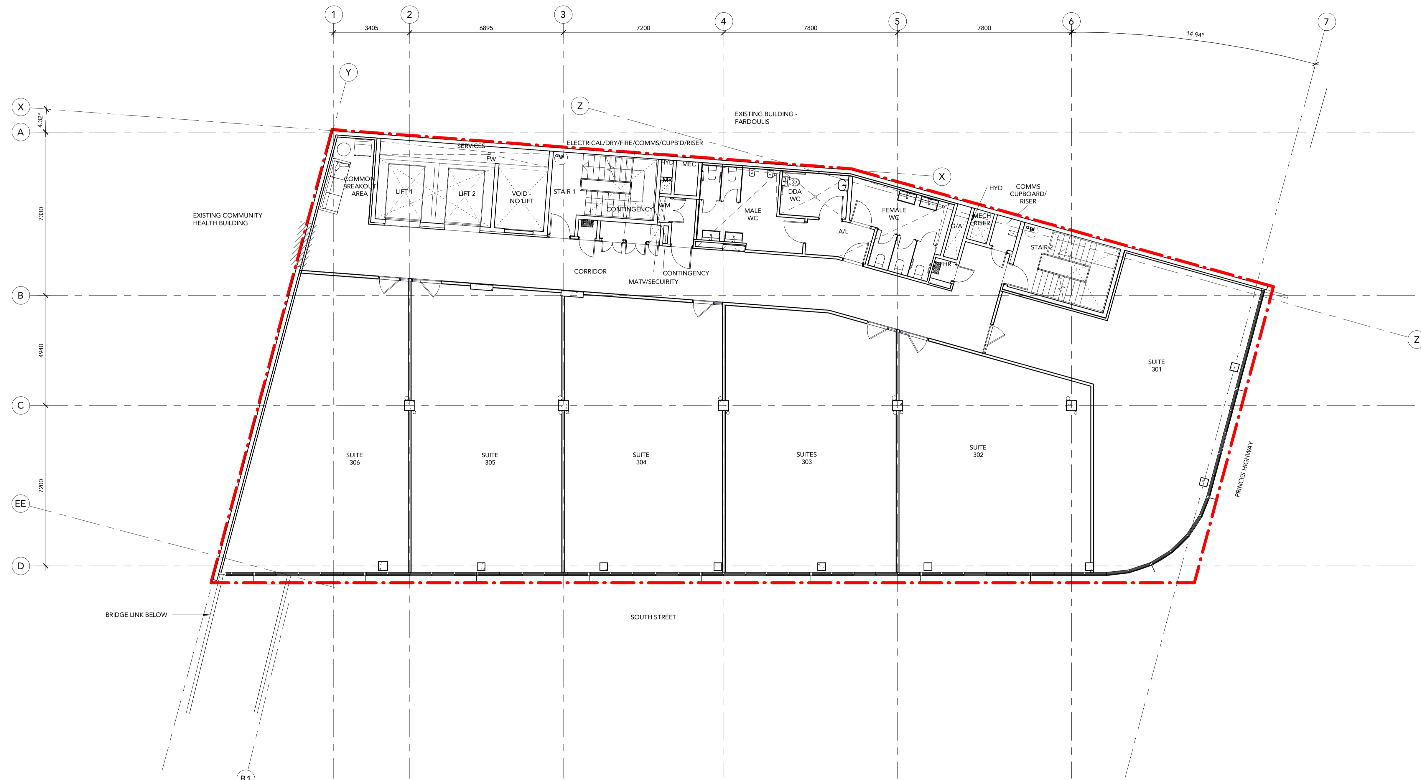
1 TYPICAL FLOOR PLAN LEVEL 3 TO 5 Scale: 1 : 100